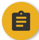
Analytics & Reports