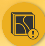
Health Change Maps & Notifications