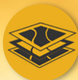
Crop Health Maps