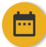
Jobs & Assets