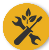
Tech & Agronomic Support