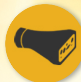
CanPlugs™ In-field telematics & data transfer devices